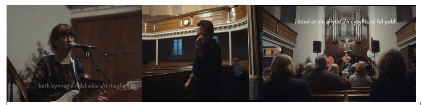
Tabernacl being used as a venue for <u>@othervoices</u> <u>@lleisiaueraill</u>